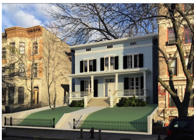
The Landmarks Preservation Commission okayed this remodeling plan for Crown Heights' decrepit 1375 Dean St. Photo montage by NC2 Architecture via the Landmarks Preservation Commission